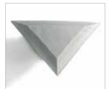
LOCTITE syntactic core machined shape