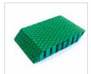
LOCTITE expanding syntactic film